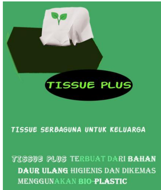
Low aesthetic quality advertisement with substantive environmental claim