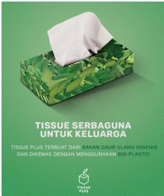
High aesthetic quality advertisement with substantive environmental claim