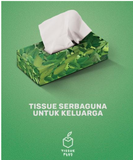
High aesthetic quality advertisement with no environmental claim