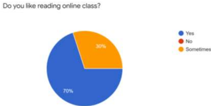
Figure 5: Students' Respond in Reading Learning Processes

their lecturers. As a result, half of them believe they comprehend the reading material, while the other half do not. However, this presents the new question that everyone's knowledge of a subject is influenced by distinct elements. Some of these variables, such as lecturers' ineffective teaching strategies, students' varying abilities, and technical limitations, cause them to be less clear in their attention to the learning process.