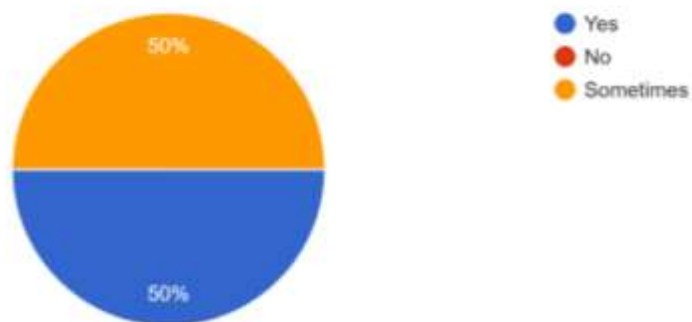
Figure 4 : Understanding Material by Learners

The following graphic shows the most important factor in determining a lesson's effectiveness, specifically, students' comprehension of the material presented by