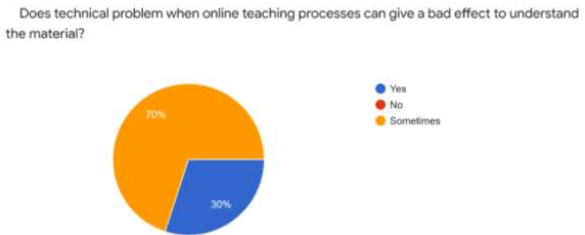
Figure 2: The Impact of Technical Problems in Students' Understanding

themselves in a variety of ways, including issues with online learning facilities such as cellphones that do not support various online learning applications, laptops that have limitations in adjusting the capacity of new applications that support online lectures, and signals that are frequently troubled that can make them unable to join with the online class. Most of them are from a variety of regions that have different qualities of a signal. This may affect learners' comprehension of the material presented.